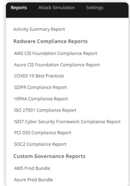
Image 2: Skyhawk Synthesis provides many comprehensive reports for internal and external compliance initiatives. Custom reports can also be created to ensure the cloud is used and managed exactly as the business requires.

Contact us today to learn more! skyhawk.security/get-free-cspm/