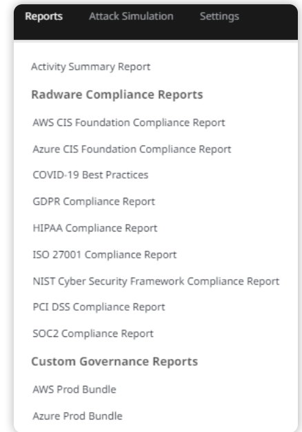
Image 2: Skyhawk Synthesis provides many comprehensive reports for internal and external compliance initiatives. Custom reports can also be created to ensure the cloud is used and managed exactly as the business requires.

Contact us today to learn more! skyhawk.security/get-free-cspm/